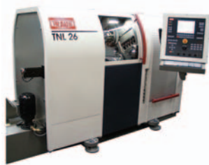
INDEX - Traub TNL26 Turn Mill Center