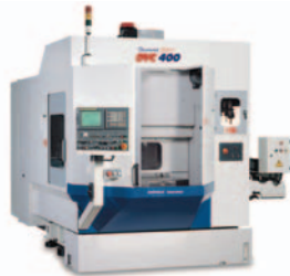
Daewoo DVC-400 Vertical Machining Center