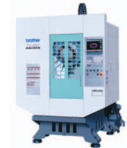
Brother TC-S2C-O Drill / Tap Machining Center

T ECHNI's 60,000 psi CNC waterjet cutting systems will cut practically any material up to 6" thick including metals, stone, glass, textiles, foam and rubber. The Intec 35 with 50 HP KMT Intensifier will be demonstrated.