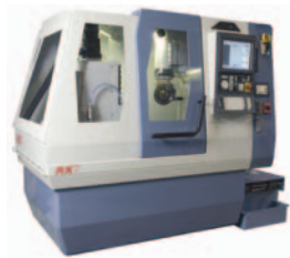
ANCA RX7 CNC Tool & Cutter Grinder