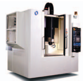
Makino S56 Vertical Machining Center

O riginally built to produce Brother sewing, fax machines and printers, Brother drill / tap machining centers are incredibly productive due to lightning quick movements and the elimination of non-cutting time. We'll demonstrate the TC-S2C-O with Brother's new CNC control technology.