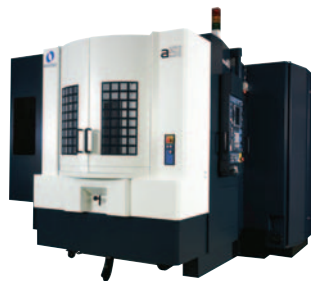
Makino a51 Horizontal Machining Center