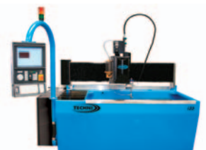
TECHNI Intec 35 with 50 HP KMT Intensifier