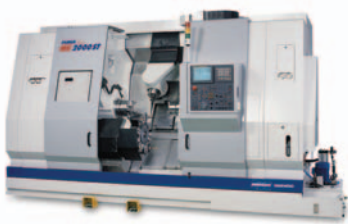
New Doosan Infracore - Daewoo PUMA MX 2000ST Multi-Task Turning Center

Plan to Attend this Spectacular Event Wednesday & Thursday May 10 & 11!