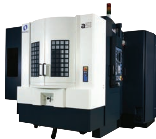
Makino a51 Horizontal Machining Center