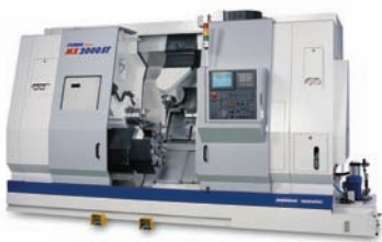
New Doosan Infracore - Daewoo PUMA MX 2000ST Multi-Task Turning Center

We look forward to seeing you at ASI's new Tech Center soon!