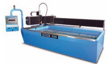
TECHNI Intec 510 Waterjet Cutting System