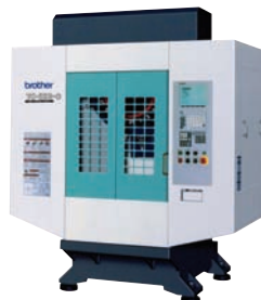
Brother TC-S2B-0 Drill/Tap Machining Center